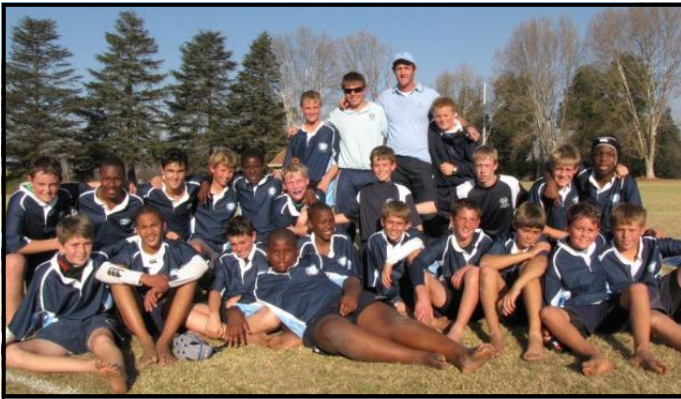
The Rugby side celebrate a hard fought and narrow win 22-21 vs Howick Prep while on Winter tour.