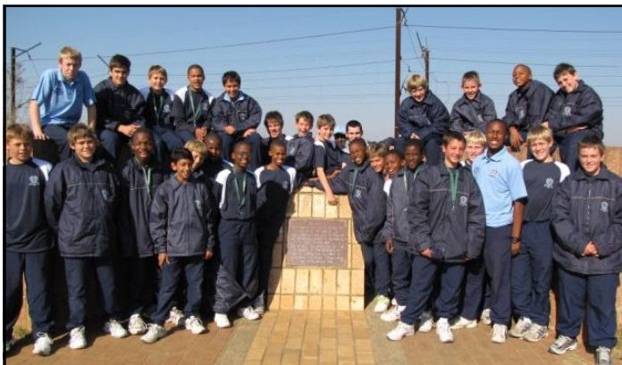
The Winter Tour Group at the Nelson Mandela Capture Site Memorial in KZN.

"There is more to life than increasing the speed!" Mahatma Ghandi