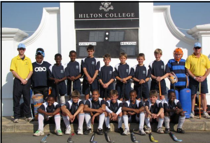
The Hockey side played 3 games at the Hilton College Astro during the tour, vs. Howick Prep, Cordwallace and Clifton.