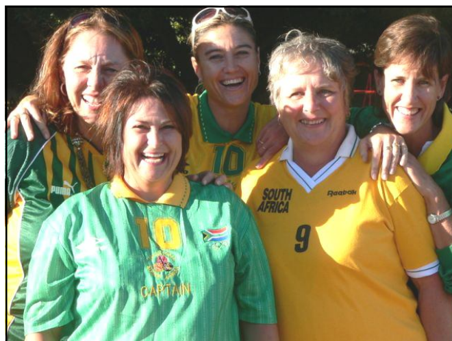
The Junior Prep Staff get into the 2010 spirit!

Any willing hands who would like to help cover books , please let us know. We have some new readers that need covering. Many thanks.